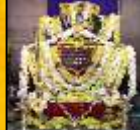
Sri Guru Raghavendra Swamy Mutt Channapatna