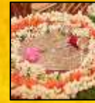
Sri Sadhguru Chaitanya Mandira Uttarahalli, Bengaluru.