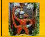
Sri Varadanjaneya Swamy Devasthanam Seva Trust JP Nagar, Bengaluru.