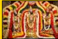
Sri Channakeshava Swamy Temple Kolar District