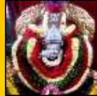
Sri Vidya Ganapathi Temple Gnana Bharathi, Bengaluru.