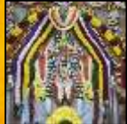
Sri Subrahmanyeshwara Swamy Temple Kumara Park, Bengaluru