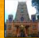
Sri Gangamma Devi Temple Malleshwaram, Bengaluru.