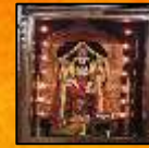
Sri Venkateshwara Swamy Devasthanam Basavanagudi, Bengaluru