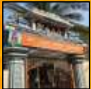
Sri Ram Mandir Trust Basavanagudi, Bengaluru