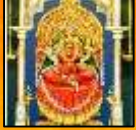
Sri Sringeri Shankara Matha Chamrajpet, Bengaluru