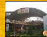
Sri Shankara Vidya Kendra Delhi