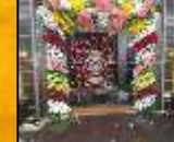
Kannika Parameshwari Temple Rajajinagar, Bengaluru