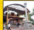
Sri Lakshmi Venkateshwara Swamy Temple Kamakya, Bengaluru